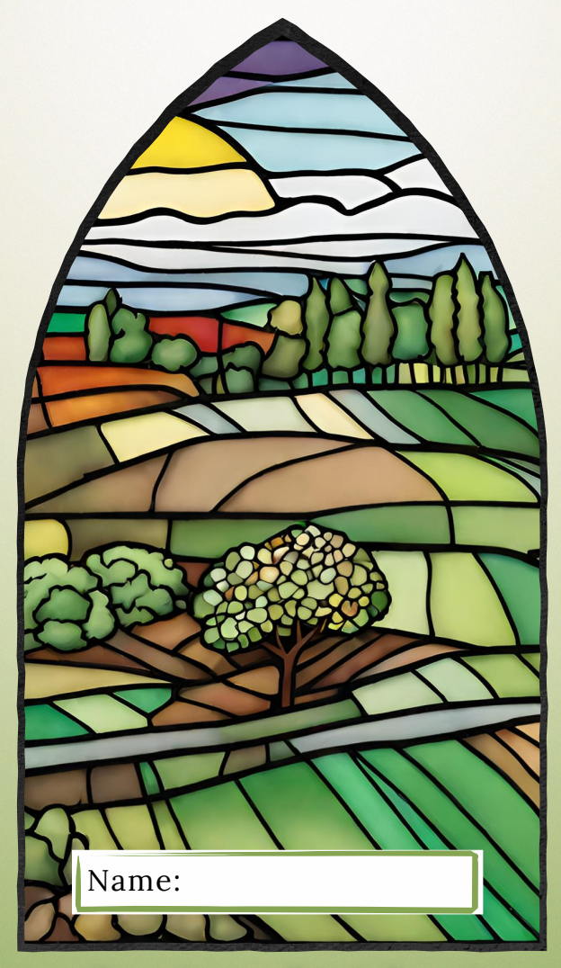
Series Guide 4

Use this guide for deeper discipleship as we journey together through